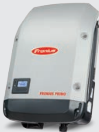
/ FRONIUS PRIMO 3.0 - 8.2 kW 1-phase