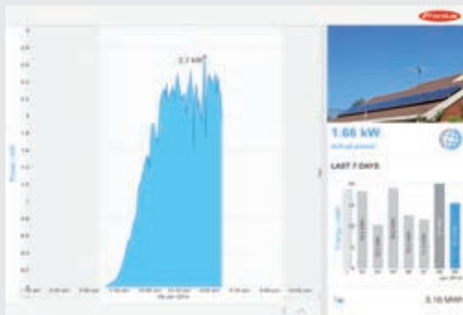
Fronius Solar.web App