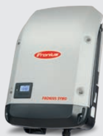
/ FRONIUS SYMO 3.0 - 20.0 kW 3-phase