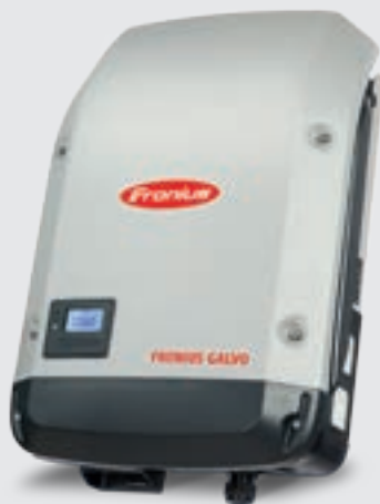
/ FRONIUS GALVO 1.5 - 3.1 kW 1-phase

perfectly optimised for your self-consumption system. Now, for the first time, the inverters are also equipped with a WLAN interface inside the device. Your photovoltaic system is therefore wirelessly connected to the internet so you can call up your system data whenever you want.